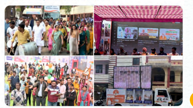
Housing For All @PMAYUrban · Dec 18, 2023 Glimpses of #ViksitBharatSankalpYatra from Odisha.

#HumaraSankalpViksitBharat #ViksitBharat